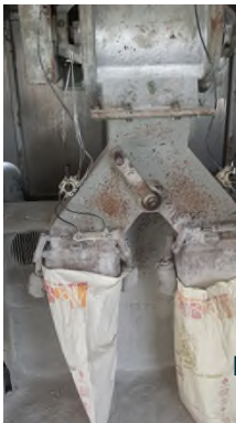
Bagging of ash, sold as fertilizer